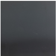
Steel - Hot Rolled

* Custom options available, please inquire