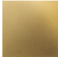
Architectural Bronze - Satin